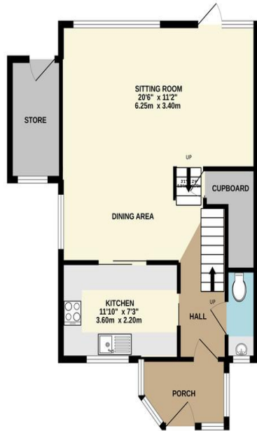
GROUND FLOOR 628 sq.ft. (58.4 sq.m.) approx.